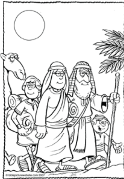
The LORD had said to Abram, "Leave your country, your people and your father's household and go to the land I will show you." Genesis 12:1 (NIV)

Unscramble each word, then use the marked letters to reveal the secret message.