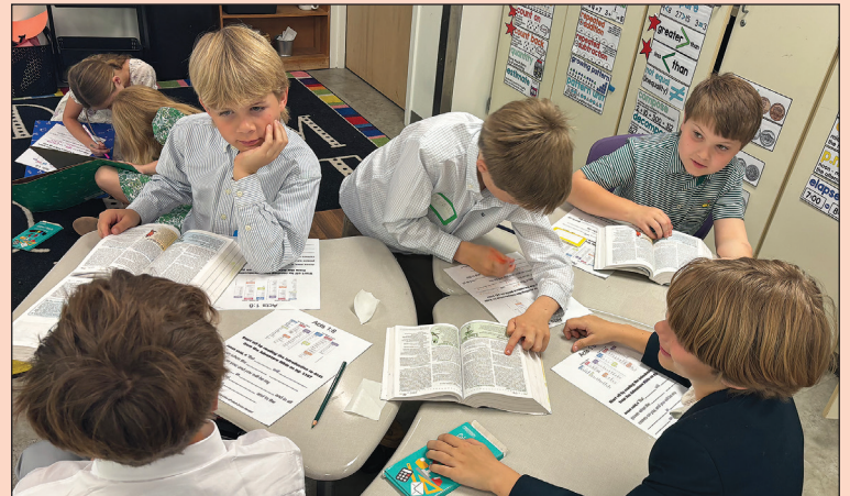
Above: 3rd graders enjoy Bible navigation activities and fellowship time during 9:00 Children's Church.

Above: 3K children enjoyed making a balloon with Jesus on it and watching the balloon go up but come back down... just like Jesus will do one day!