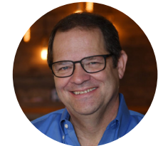
FRIDAY TAL PRINCE Counselor Insights Counseling Center Birmingham, Alabama